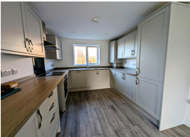
Address: 8, Kingston Farm Lane, East Cowes, PO32 6LL RRN: 9350-2858-2020-2007-1705